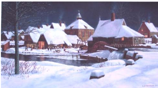
Schenectady Town, View from Cowhorn Creek, circa 1690

If you have not had a chance to go and view the trees. It is certainly worthwhile and they are really decorated beautifully - The Stockade Tree, The Red Hat Tree, The Gazette Tree, The Rotary Tree and many, many more. Some at the YWCA and some are at the Historical Society. AND while you are there you should pick up some of the books about Schenectady - past & present. They make wonderful Christmas gifts for your Nijkerk friends and your family. They have the Schenectady Throw, decorated Christmas Ball ornament - you can check on your history just by asking. If you become a member (about $50.00) you get a discount on your purchases - of course there are other perks. Just helping you with your Christmas shopping!! There is a charge to visit the trees - I think that it is $5.00.