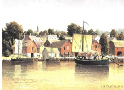
Schenectady Harbor, 1814